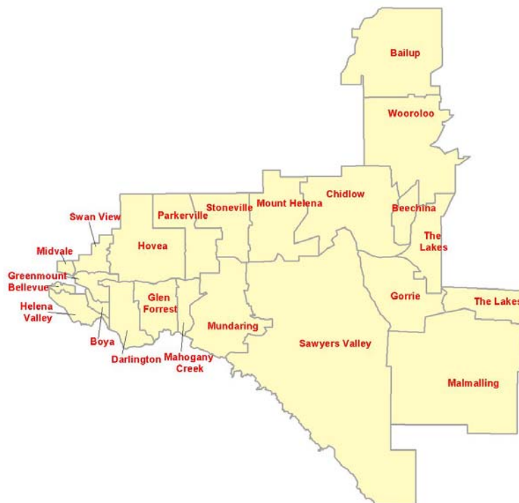
Map: Shire of Mundaring

A feature of the shire is the natural bush environment and open space. The freedom and lifestyles that this environment provides are highly valued by the young people that live here.