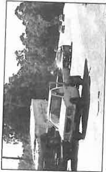
Crossing Great Eastern Highway is a concern for pedestrians.