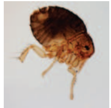
Figure 6. Stickfast flea.

Stickfast fleas are typically a summer/autumn condition. Birds can be infested with hundreds of parasites, particularly around the comb and eyes. Treat with a registered treatment. Repeated treatment of the environment will reduce reinfestation. Pet cats and dogs can also be affected.