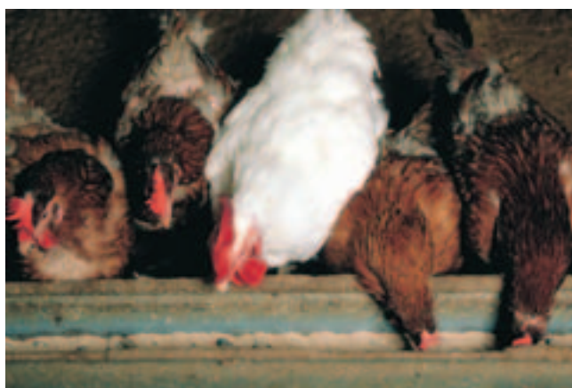
Figure 4. Chickens need a clean supply of good quality food.

Chooks should have full time access to good quality nutrition, with the right quantities and balance of all the essential nutrients. If the quantity or balance is wrong, egg production or bird health will suffer. If, for example, the protein level in the diet is too low, you will get fat birds, but no eggs.