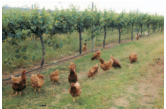
Figure 2. For small landholders chickens provide valuable pest control.