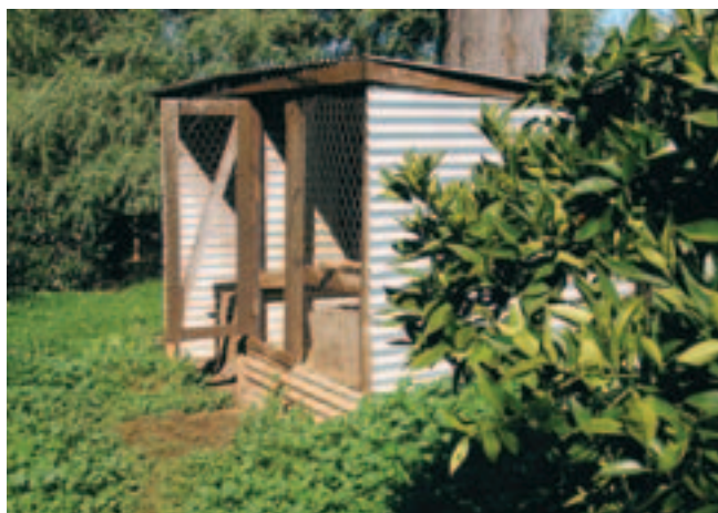
Figure 3. A chicken house should be fox-proof.

The chook house should contain a perch for roosting, and nesting boxes which can be emptied from the outside.