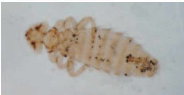
Figure 5. Chicken louse.

Poultry lice eat dead skin and feather dander, and can cause severe irritation and stress. Birds often stop laying. Treat with a registered poultry dust.