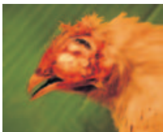
Figure 8. Fowl Cholera

Fowl Cholera causes reduced egg production and increased mortality. Birds appear depressed and anorexic for a few days prior to death. The disease may spread slowly throughout the flock or very rapidly. Stress predisposes birds to Fowl Cholera. Antibiotics can be used to treat Fowl Cholera, but on some properties only total destocking is effective for long-term control.