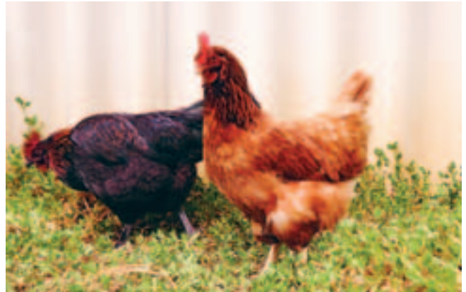
Figure 1. Backyard chickens provide eggs and eat food scraps.