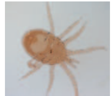
Figure 7. Chicken mite.

Mites and ticks are blood-sucking parasites that can be difficult to see. They can also be involved in the spread of other diseases. Mites and ticks may spend considerable time off the host and therefore it is essential to treat the environment, particular any nooks and crevices such as in wooden surfaces. Ticks can survive several years in hot, dry conditions without any birds being present, so beware of using old poultry facilities.