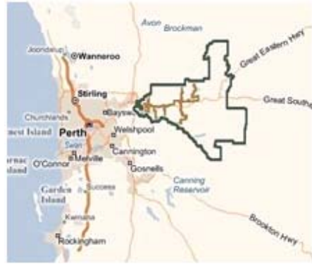
Shire in context with Perth area

Mt Helena Population 12-24 years: 502 SEIFA Index: Outer Eastern Region: 1036.82