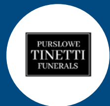
Purslowe Tinetti Funerals