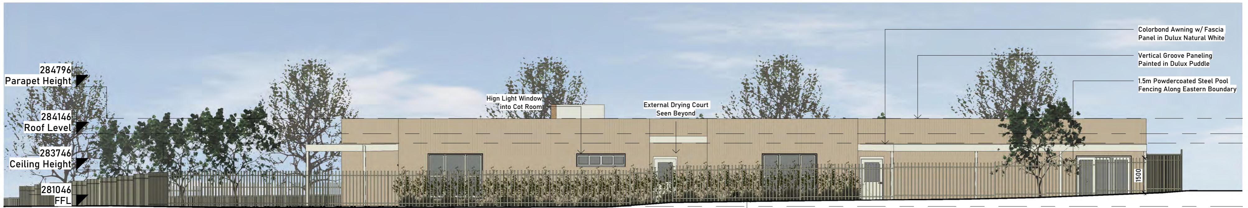
2 Eastern Site Elevation A105 1:100