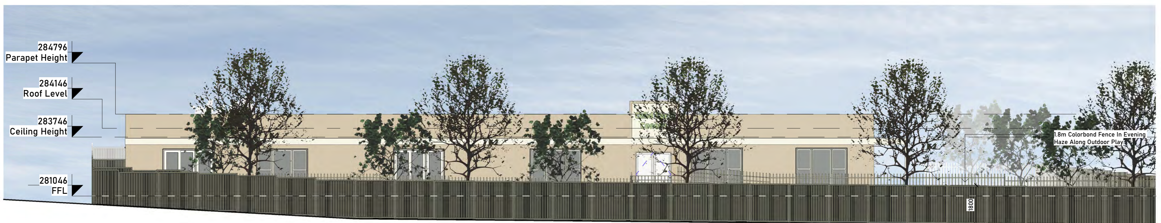
4 Western Site Elevation A105 1:100