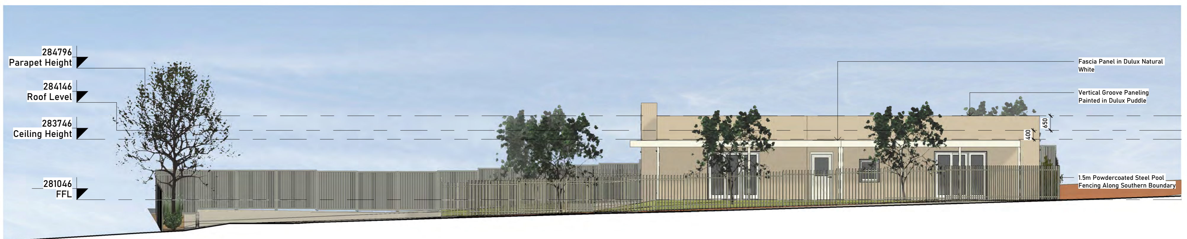
3 Southern Site Elevation A105 1:100