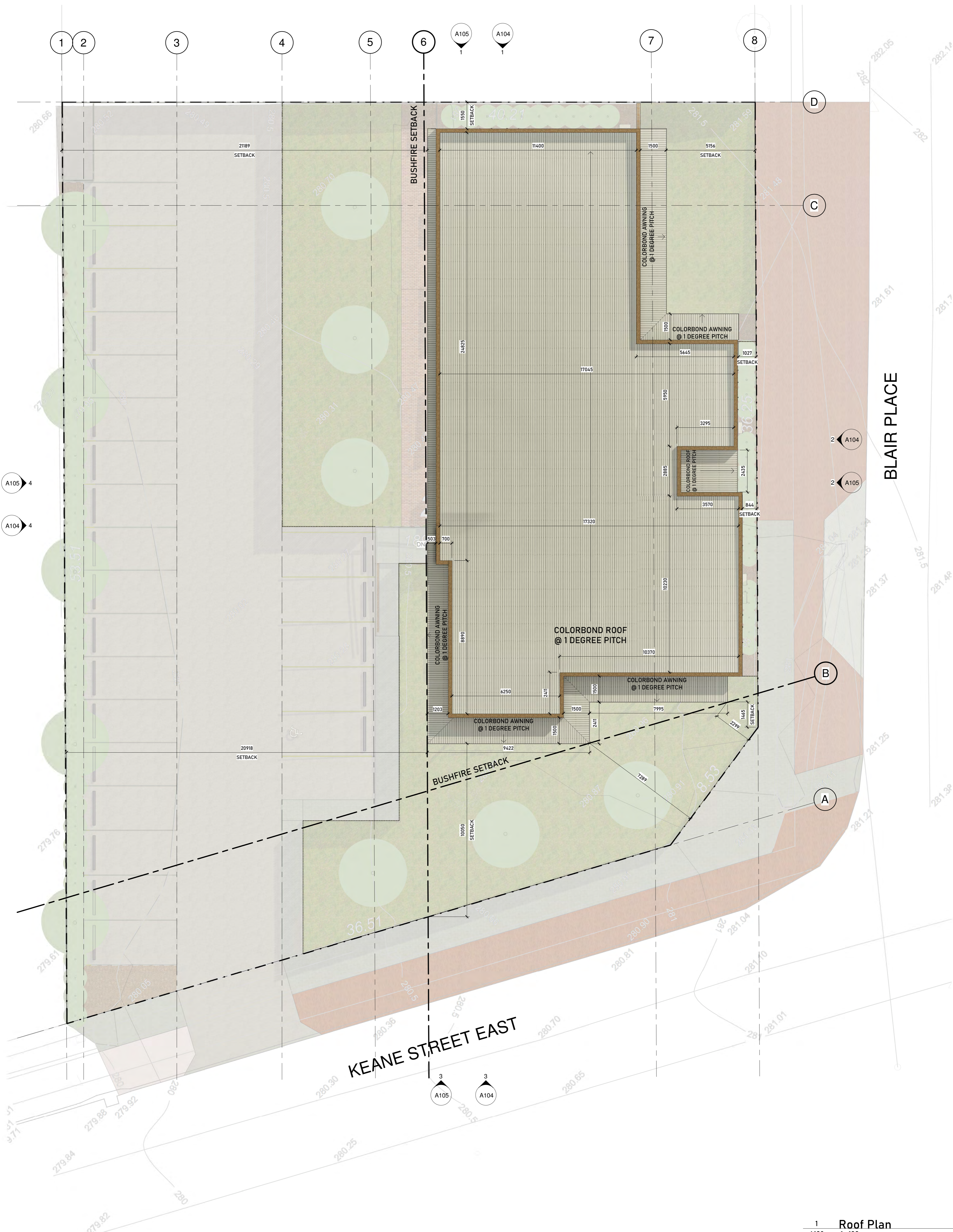
1 Roof Plan A103 1:100