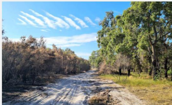
The spread of the Eaton fire (left of the track) was stopped as it approached the recent planned burn (right of track).

This allowed both firefighters on the ground and water bombing aircraft to focus primarily on asset protection of the adjacent houses along Forrest Highway. This ensured no houses or built assets were lost and the fire was kept small, meaning community, infrastructure and environmental impacts were minimised.