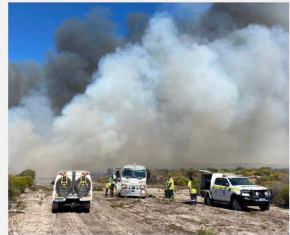
Volunteers from the DFES Lower South West Region participating in mitigation deployments to reduce bushfire risk in Yanmah (top) and Derby (bottom left).