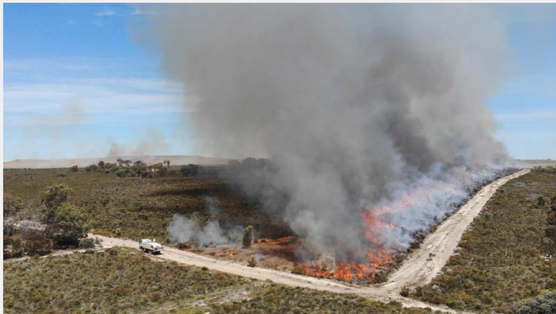
Volunteers from the DFES Midwest Gascoyne Region participate in mitigation deployments with DFES staff, local government and DBCA on a series of cross tenure burns in Kalbarri.

In addition to the work being undertaken by the DFES Bushfire Mitigation Branch (see Recommendation 4 update), DFES Regional teams across all of WA deliver a range of bushfire mitigation programs to achieve various outcomes. Mitigation programs are a core part of each region's preventative efforts to both reduce bushfire risk and actively involve the community in managing their risks. All DFES regions work around the year to deliver mitigation programs and a few recent examples are included on the following pages.