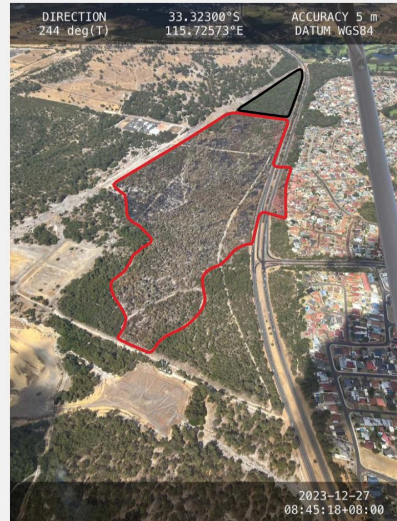
The planned burn (black) was critical in minimising the impacts of the Eaton fire (red) on the local community.