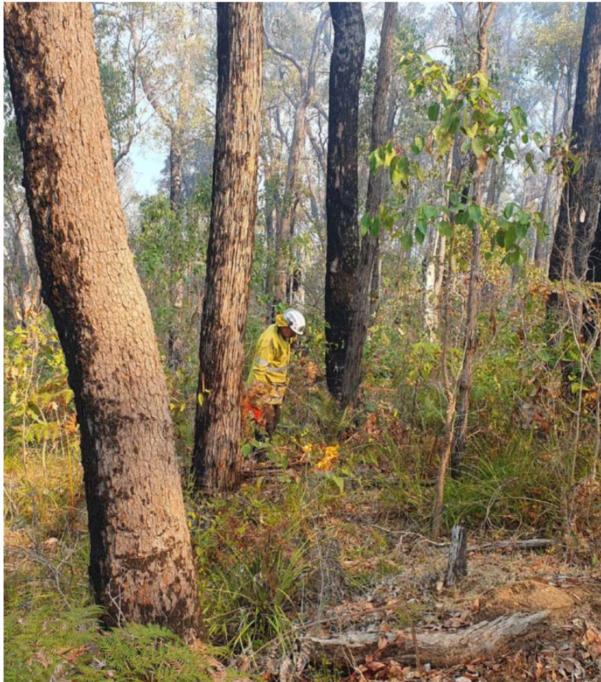
Volunteers igniting a planned burn in the DFES Lower South West Region. For further information, see Appendix 1-Case Study: Delivering bushfire mitigation programs in regional WA.