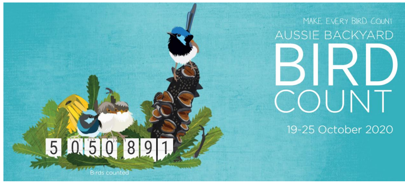
Figure 3. 'Aussie Backyard Bird Count' 2020 promotional image, courtesy of BirdLife Australia.

The Aussie Backyard Bird Count (ABBC) is one of the largest citizen science projects in Australia, with 88 270 people participating across Australia in 2019, submitting a total of 105 888 counts. The purpose of the count is to help BirdLife Australia develop and understanding of local birds, while giving the participant a chance to get to know the wildlife that lives nearby (BirdLife Australia, 2020b). The project has run every year since 2014, during National Bird Week, and focuses on identifying broad trends in the distribution and abundance of bird species across Australia.