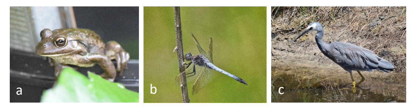
Figure 2. Examples of local aquatic biodiversity that may benefit from habitat provided by farm dams (a) a frog (b) a dragonfly, and (c) a white-faced heron (photos courtesy of Graeme Worth).

The scientific aims of this research project were to determine 1) the native freshwater biodiversity supported by farm dams, and 2) whether paddock (isolated) and on-channel dams support different components of native freshwater biodiversity, 3) identify which characteristics of farm dams are associated with high numbers of native species (Robson and Chester, 2019). In addition, there was a fourth aim; "to train landholders as citizen scientists and increase the capacity of all landholders with farm dams to manage them to sustain native biodiversity through web-based knowledge dissemination".