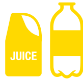
Plastic bottles and containers (lids removed)