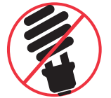
No light globes