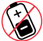
No batteries or hazardous waste