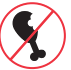
No food scraps

If you're unsure what should go in your yellow lid recycling bin or how to dispose of the above items, find the answer online at recycleright.wa.gov.au