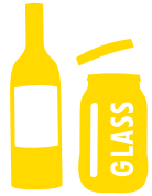
Glass bottles and jars (lids removed)