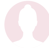
Position to be filled in 2025